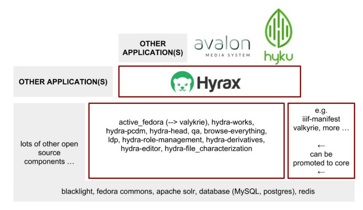
Figure two: the anatomy of a Samvera application, exploded