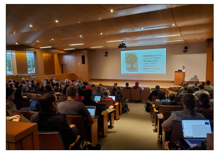
The opening session at Samvera Connect 2019 in St Louis

Samvera's Interest and Working Groups continue to flourish with a healthy cycle of some being "sunsetted" whilst new ones are formed. These Groups are an essential part of the Community's development work and we much appreciate the amount of time and effort that goes into their work.