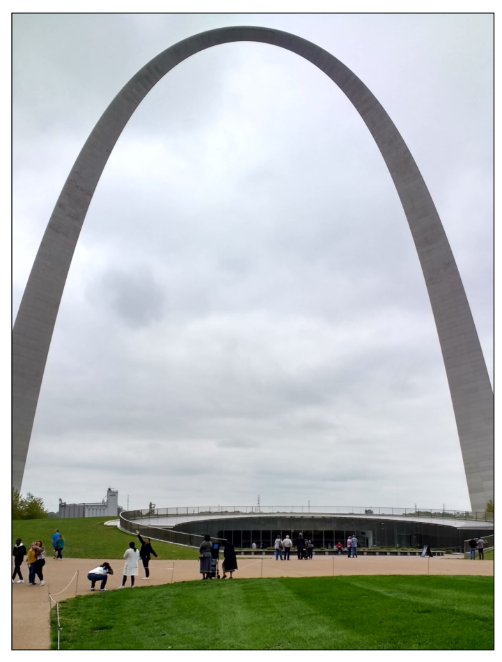
The famous 630-foot Gateway Arch in St Louis

likely to become a regular feature of Connect conferences going forward.