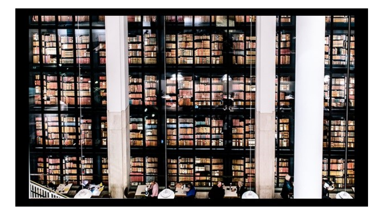
A slightly more traditional 'take' on the British Library!

the use of persistent identifiers, so we have included DataCite integration and nested metadata to incorporate ISNI and ORCIDs. The templates are identical for each tenant, with some customisation for each organisation's DataCite account and their institution name (which appears in the shared search results to denote which repository an output sits in).