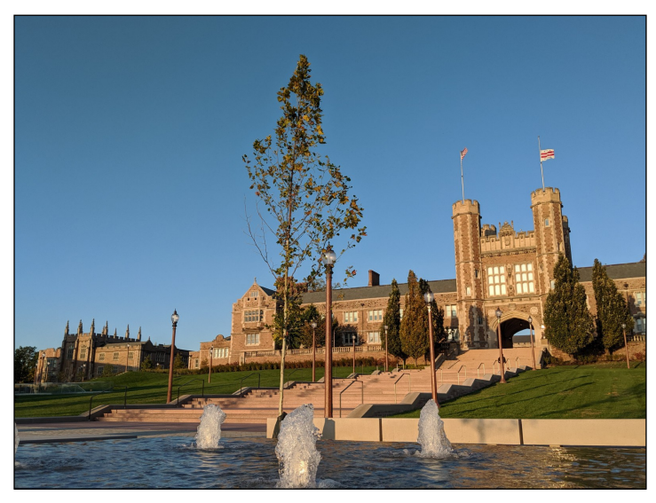
Part of the beautiful Washington University in St Louis campus

Samvera's Community members on the West Coast US met at the UCSD library for a wide-ranging set of unconference sessions.