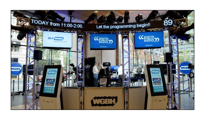
The WGBH studio at the Boston Public Library

At the end of the AMS2.0 project, WGBH MLA was awarded an NEH Challenge grant to build capacity and infrastructure at WGBH MLA including the digitization and preservation of about 1/3 of the collection that is on obsolete and aging formats, close to 83,000 items. Part of the infrastructure build was to develop a system to manage the created digital files for internal access and use. WGBH MLA decided to use the Samvera solution bundle Avalon, as is, over Hyrax for internal WGBH content. There are a good number of examples of people successfully using Avalon in production, and for WGBH, with very little development required. WGBH MLA successfully mapped WGBH's data model (based on PBCore descriptive fields) onto the Avalon data model, and successfully tested the Avalon Ingest API, which ingests records and points to media stored in a separate system. The MLA is collaborating with WGBH internal IT department on Docker. The IT department runs Rancher to manage Kubernetes clusters of Docker containers. The MLA worked with them to get Avalon running in a production-like environment, for testing ingest speeds. Search is available through facets as well as key words. Once we have installed and are using Avalon in its current form, we plan to begin offering contributions to the community for further enhancements and upgrades. We may even opt for a hosted version of Avalon.