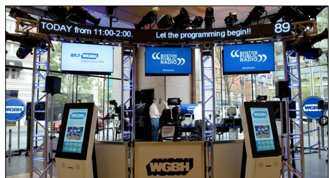
The WGBH studio at the Boston Public Library

At the end of the AMS2.0 project, WGBH MLA was awarded an NEH Challenge grant to build capacity and infrastructure at WGBH MLA including the digitization and preservation of about 1/3 of the collection that is on obsolete and aging formats, close to 83,000 items. Part of the infrastructure build was to develop a system to manage the created digital files for internal access and use. WGBH MLA decided to use the Samvera solution bundle Avalon, as is, over Hyrax for internal WGBH content. There are a good number of examples of people successfully using Avalon in production, and for WGBH, with very little development required. WGBH MLA successfully mapped WGBH's data model (based on PBCore descriptive fields) onto the Avalon data model, and successfully tested the Avalon Ingest API, which ingests records and points to media stored in a separate system. The MLA is collaborating with WGBH internal IT department on Docker. The IT department runs Rancher to manage Kubernetes clusters of Docker containers. The MLA worked with them to get Avalon running in a production-like environment, for testing ingest speeds. Search is available through facets as well as key words. Once we have installed and are using Avalon in its current form, we plan to begin offering contributions to the community for further enhancements and upgrades. We may even opt for a hosted version of Avalon.