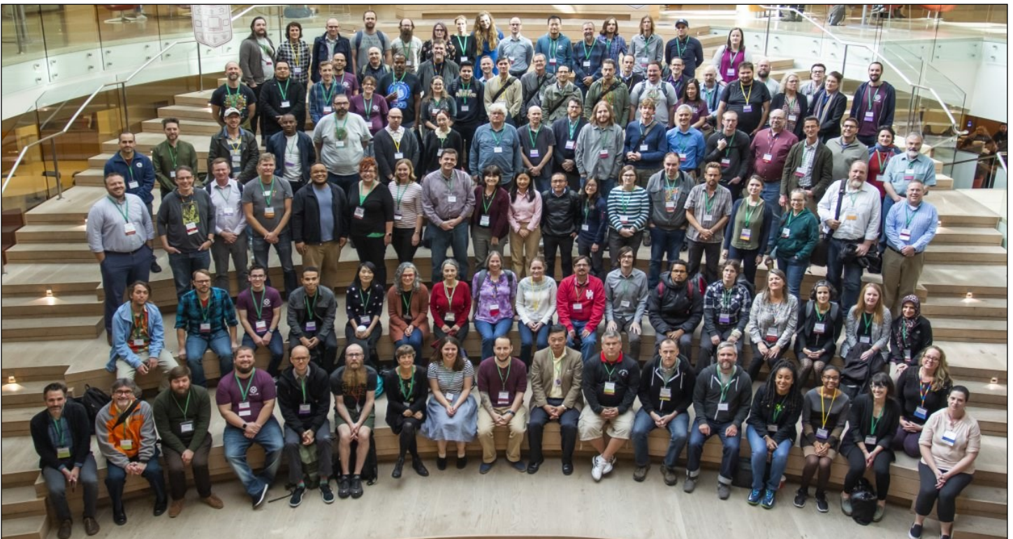
Samvera Connect brought together some 150 participants—most of them pictured here!