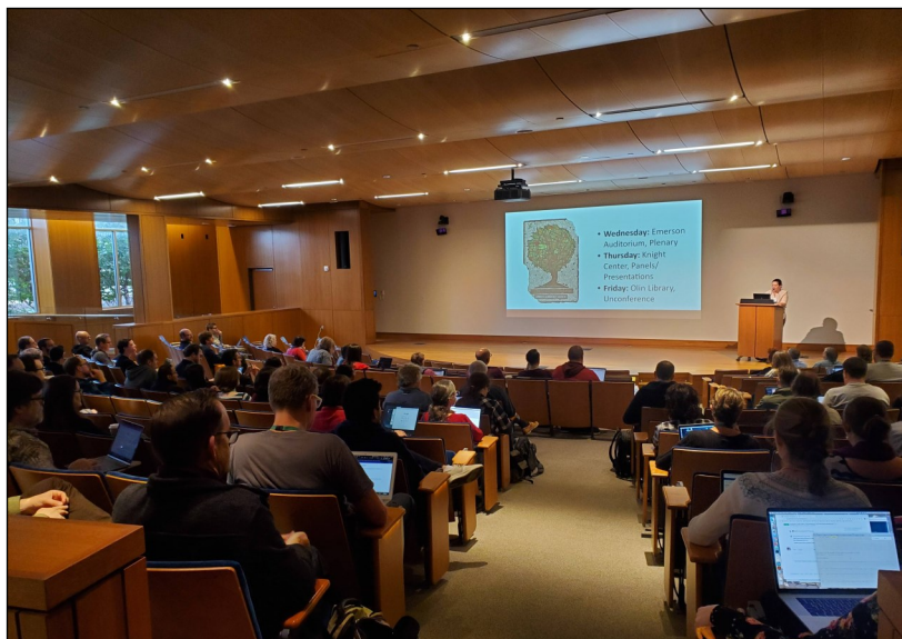
The opening session at Samvera Connect 2019 in St Louis

Samvera’s Interest and Working Groups continue to flourish with a healthy cycle of some being “sunsetting” whilst new ones are formed. These Groups are an essential part of the Community’s development work and we much appreciate the amount of time and effort that goes into their work.