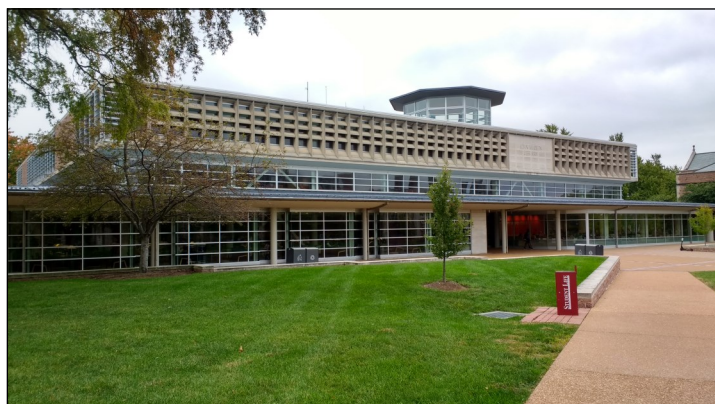
The library at ‘WashU’ - the venue for many of the Connect 2019 sessions

27-30 October 2020 | Hilton Santa Barbara Beachfront Resort, Santa Barbara, CA