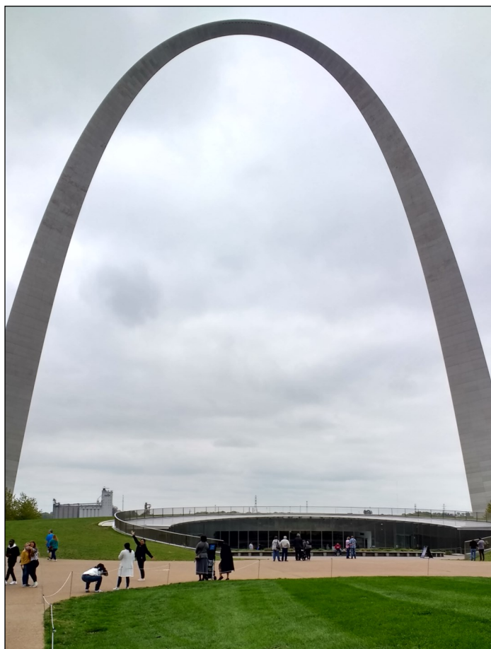
The famous 630-foot Gateway Arch in St Louis

likely to become a regular feature of Connect conferences going forward.