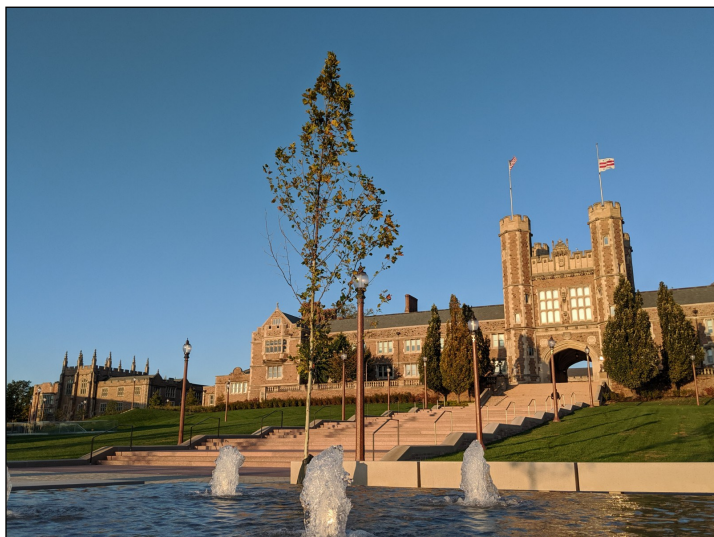
Part of the beautiful Washington University in St Louis campus

Samvera’s Community members on the West Coast US met at the UCSD library for a wide-ranging set of unconference sessions.