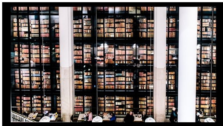
A slightly more traditional 'take' on the British Library!

We selected Hyku from a strong field of repository solutions primarily due to its flexible architecture, which appealed to us due to its ability to host multiple tenant repositories on one instance. We worked closely with our development partners, Ubiquity, to develop metadata templates that accommodated our research outputs, including exhibition material, 3D models of our collections and datasets. We have used the repository to help meet deliverables in the EU-funded Freya project exploring