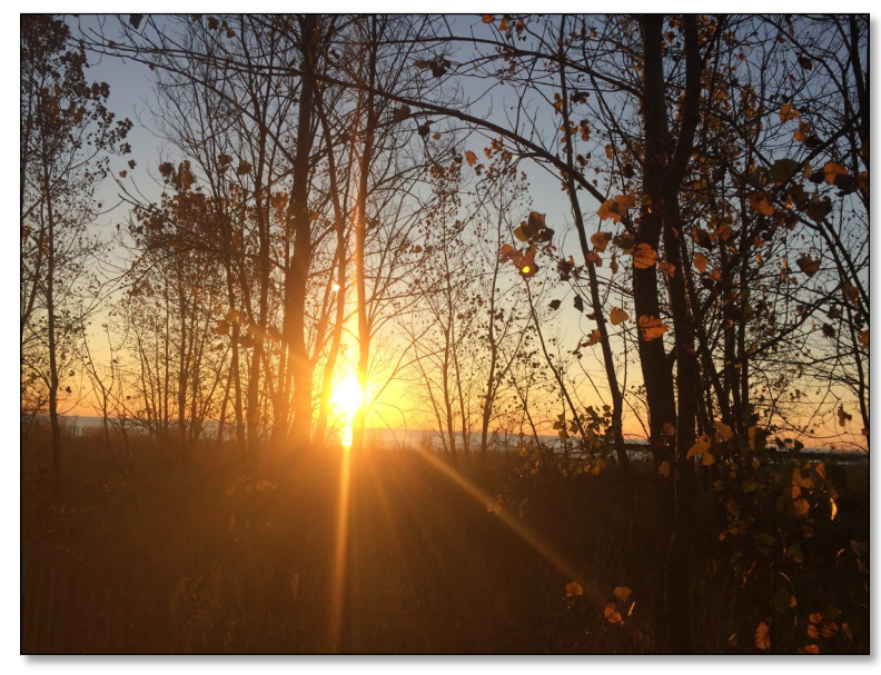
Sunrise over Lake Michigan—one of the side benefits for those who attended Connect 2017

On the technical front, 2017 saw the bringing together of two of our major software gems, Sufia and Curation Concerns, into a new gem called Hyrax which contains functionality from both. In addition, another new gem, Valkyrie, has been developed which opens up a number of options for combining different types of back-end storage under a Samvera repository. Our developers held a number of face-to-face events to help facilitate these developments.