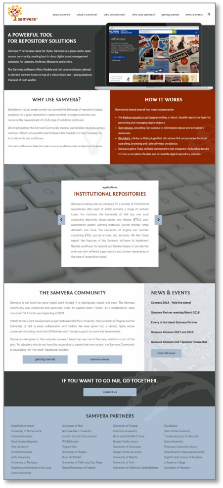
The new Samvera website home page