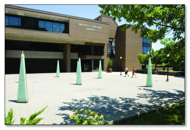
The Walter C Langsam Library at the University of Cincinnati

Next for Cincinnati is to upgrade our Samvera environment to support multiple Hyrax ingestion interfaces, distinguishing ingest and publishing mechanisms for self-deposited IR content from curator-driven cultural heritage content. The latest version of Hyrax, with its enhanced support for collections, workflow and administrative parameters, is a critical component of this effort. This will allow us to continue to support our IR content while also moving our growing cultural heritage content out of legacy repositories and into the Samvera repository.