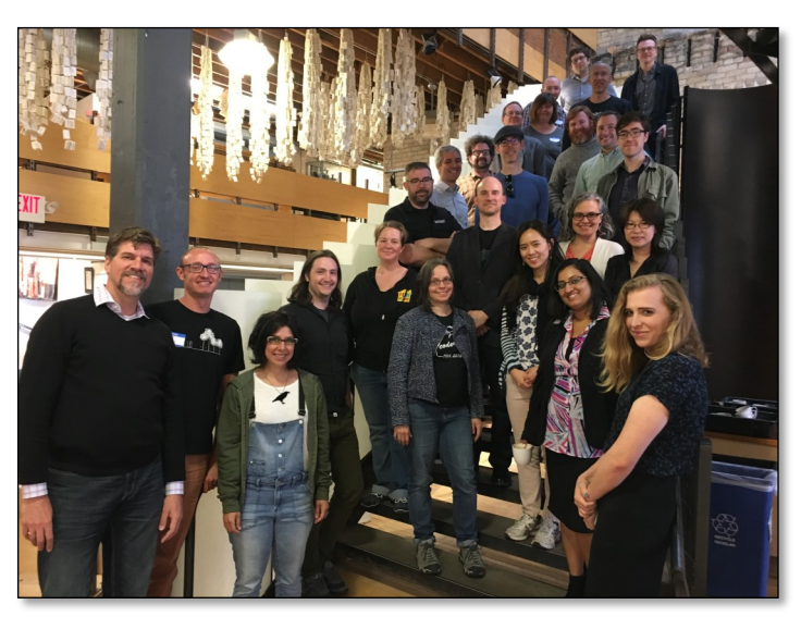
The first Advanced Hydra Camp in Minneapolis

metadata, background jobs, workflow and notifications, UI customization, along with an overview of how Samvera interacts with Solr, Fedora, and Blacklight to provide a complete repository framework.