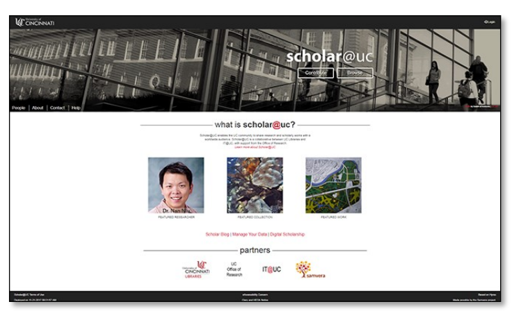
Cincinnati's Scholar@UC repository

In November of 2017 we successfully migrated this production system from the Curate / Fedora 3 platform to the Hyrax 1.x / Fedora 4 platform. The Hyrax front-end based on the Samvera framework (<a href="https://github.com/samvera/hyrax">https://github.com/samvera/hyrax</a>) is supported by a wide array of Samvera institutions. Cincinnati's migration was both a code and a content migration. We accrued benefits by having our application based on a newer and more widely-used implementation of the Samvera framework. The migration also allowed us to present new functionality to our users. This repository is Scholar@UC at <a href="https://scholar.uc.edu">https://scholar.uc.edu</a>.