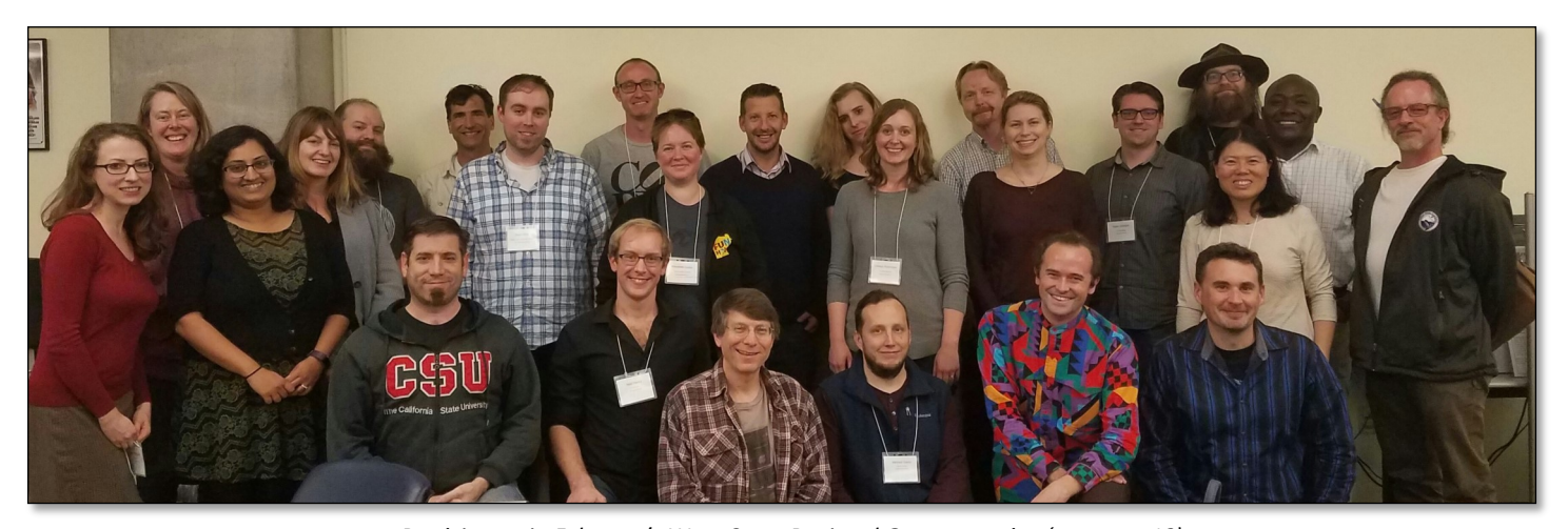
Participants in February's West Coast Regional Group meeting (see page 13)

As at December 2017 we are in the final stages of registering the Samvera name as a trademark in the US and work is ongoing to register it in Canada and Europe. We are also working to trademark our new logo in those same three jurisdictions.