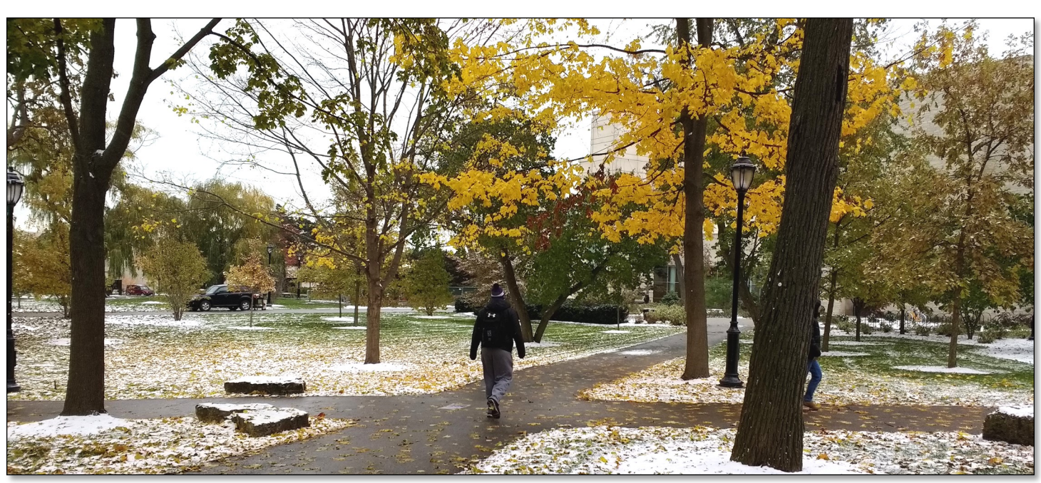
Fall colors and the winter's first snow at Northwestern University after the November Partners' meeting

This year a new gem, Valkyrie, was developed to enable Samvera repositories to use any combination of backends for metadata and binary storage they would like while still sharing code for front-end components and workflows. Currently the library supports storage of metadata in Solr, binary files on disk, in memory, and in Fedora. Three community sprints with representatives from seven different Samvera partners were undertaken with the final result being a release of v1.0.0 in early 2018, a full repository running in production using it at Princeton, and another underway at Penn State University. Participating partners have had good experiences with implementing the gem in place of ActiveFedora so far, have enjoyed working on the gem itself, and significant community contributions have gone towards using it in an upcoming Hyrax release (3.0).